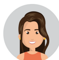
Wellframe Health Advocate