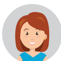
Excellus Nurse Case Manager